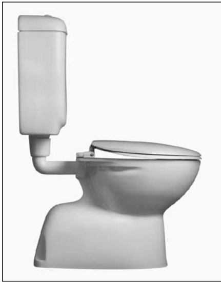
Shown with Sovereign 2000 Cistern

A distinctive 4.5 litre vitreous china toilet pan featuring rounded contours with a concealed trap for easy cleaning. The Trident pan can be coupled with the range of Caroma exposed and concealed cisterns for optimum matched suite performance. Suitable for general purpose applications and also is available in a version for persons with disabilities ♿, refer sheet 4.06.2